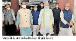
श्री बिरला (एन डीएल) कोटा

लोक सभा अध्यक्ष श्री बिरला ने मानसून सत्र 2021 में लोक सभा के कार्यकाल के दौरान